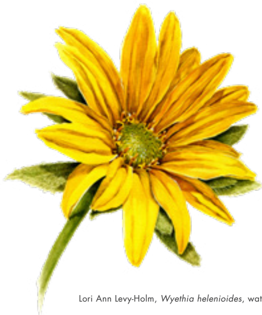
Lori Ann Levy-Holm, Wyethia helenioides , watercolor, 2024

To create line, form and texture in gradations of black and white, practice this traditional illustration medium with a variety of technical pens. Expand your drawing repertoire through step-by-step instruction, demonstration and practice so that expressive line and stipple become part of your foundational artistic vocabulary and toolkit for accurate, skillful botanical illustration.