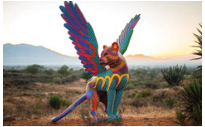
Jacobo and María Ángeles, Jaguar-Eagle , fibreglass and acrylic paint, 2024

Blend figure drawing with nature and narrative in this new class. View the exhibition Terra Incognita: Paintings by Andrea Kowch for inspiration, then work with a live model to take dramatic references photos in the gardens. The photos become source material to create an enigmatic work of art in the medium of their choice. With ongoing guidance and support from the instructor, learn the basics to depict a figure in nature in your own style.