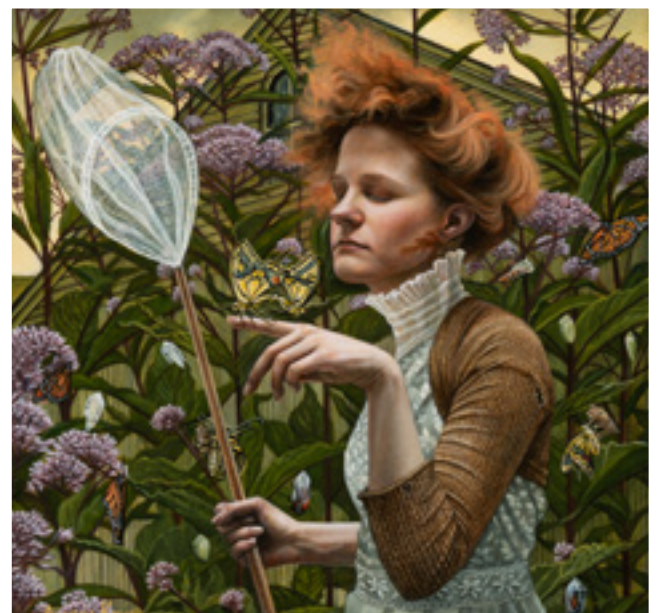
Andrea Kowch, Expectation , acrylic on canvas, 2019