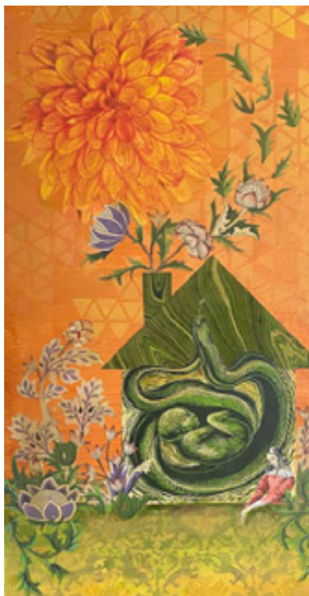
Deb Rosenbaum, House (Birth) , mixed media, 2023

Spend Halloween Eve mounting your own spooky scorpion specimen. Learn basic anatomy and lifestyle habits of scorpions before delving into techniques around relaxing and preserving your specimen. This class is sure to be a scream!