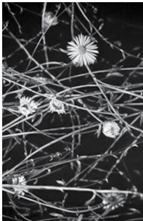
Anna Kaye, Trailing Daisy , (detail), charcoal on paper, 2021

Explore the bold, dramatic medium of charcoal drawing through fun, mark-making exercises and creative investigations into organic forms. Take inspiration from seasonal plants in the classroom and direct observation of flora in the gardens.