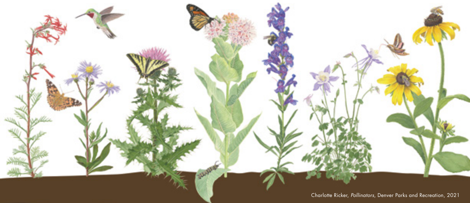
Charlotte Ricker, Pollinators , Denver Parks and Recreation, 2021

This class is a window into the methods and materials used in botanical illustration. Students receive a brief overview of the history and techniques used to create precise renderings with scientific value. Take a flower apart and look under the microscope to learn multi-sensory basic botany. Use graphite, colored pencil, watercolor and micron pens for simple drawing exercises. No art experience required and all materials supplied.