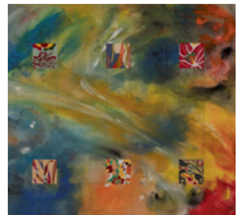
Gayle Imamura-Huffman, Kesa in Orion Nebula , gouache, 2022

Find new ways to express your unique relationship with plants through abstract art. Looking at a selection of works by historical and contemporary abstract artists, use their work to inspire a project with a plant subject of your choosing. Use a range of materials and techniques including drawing, painting and collage to help you discover a medium of expression that is right for you.