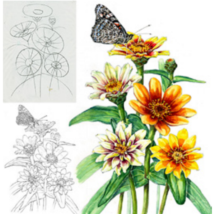
© Botanical Interests, Marjorie Leggitt, Zinnias, watercolor, 2022

Colored pencil presents a special challenge: mixing color directly on your drawing. Develop your own color workbook to speed color selection and application for future colored pencil drawings. Two-, three- and four-color mixing ensures the gorgeous greens, radiant reds and luscious lilacs you've been dreaming about. Class fee includes workbook by Susan Rubin; a curated set of colored pencils is available for sale.