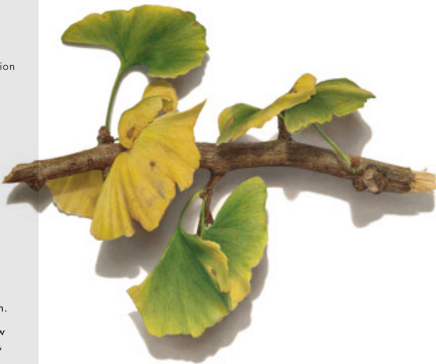
David Morrison, Ginkgo Twig Series No. 1 , colored pencil, 2023

This class brings it all together for watercolor: layering, shading, brush techniques, broad washes and building form. Draw from a live specimen to complete a finished botanical plate in this traditional medium. Discover colors that enhance perspective and depth, and gain confidence as you learn to implement final details and learn invaluable techniques to fix those inevitable “mistakes.”