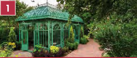
1 Solarium Dahlia Sponsorship Seating for 20 guests