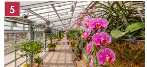
5 Orangery Orchid Sponsorship Table of 8 to 10 guests