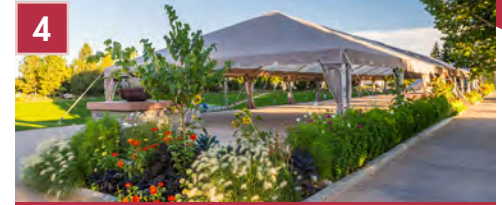
4 UMB Bank Amphitheater Tent Conservatory Presenting Sponsorship Monet Supporting Sponsorship Dahlia Sponsorship Cottonwood Sponsorship Tables of 8 to 10 guests, Individual Tickets