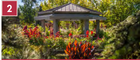
2 Water Garden Gazebo Dahlia Sponsorship Seating for 20 guests