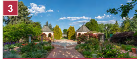
3 Romantic Gardens Primrose Sponsorship Table of 8 or 10 guests