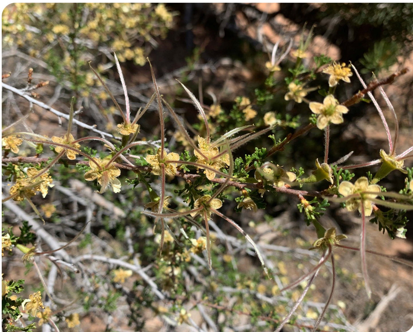
Purshia stansburiana