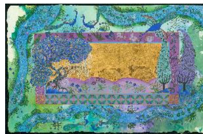
Image: Aisha Imdad, The Gardens of Eternity: Bagh-i-Wah Series II , Watercolor, Gouache and 24 kt Gold-leaf on Wasli, 2022.