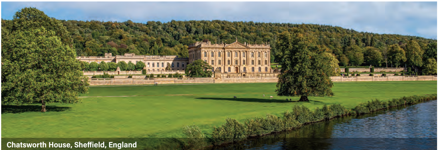
Chatsworth House, Sheffield, England

Today is given over to making your way to Edinburgh. The first leg of the journey is through Cumberland and Northumberland to the eastern coast of England, where you stop to explore Alnwick Garden.