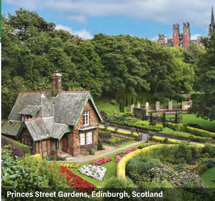
Princes Street Gardens, Edinburgh, Scotland