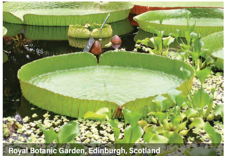
Royal Botanic Garden, Edinburgh, Scotland

Check out after breakfast and transfer to Edinburgh Airport for flights homeward. (B)