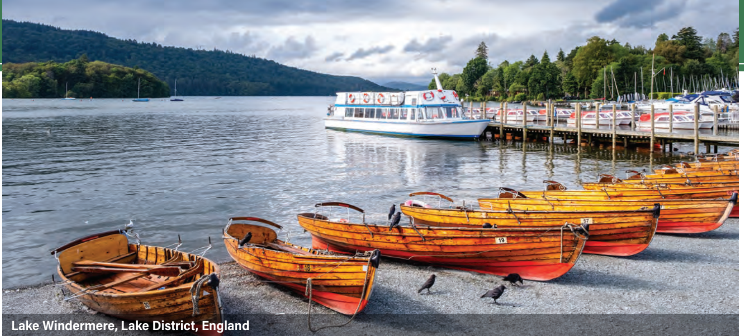
Lake Windermere, Lake District, England