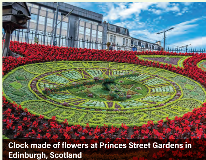
Clock made of flowers at Princes Street Gardens in Edinburgh, Scotland