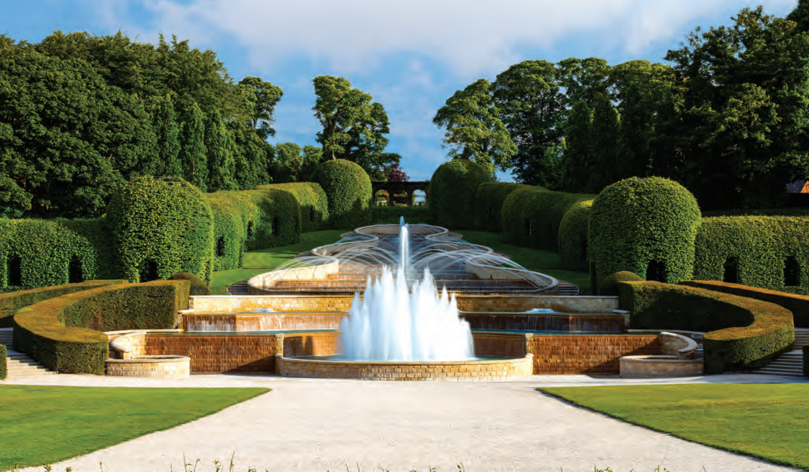
Alnwick Garden, England