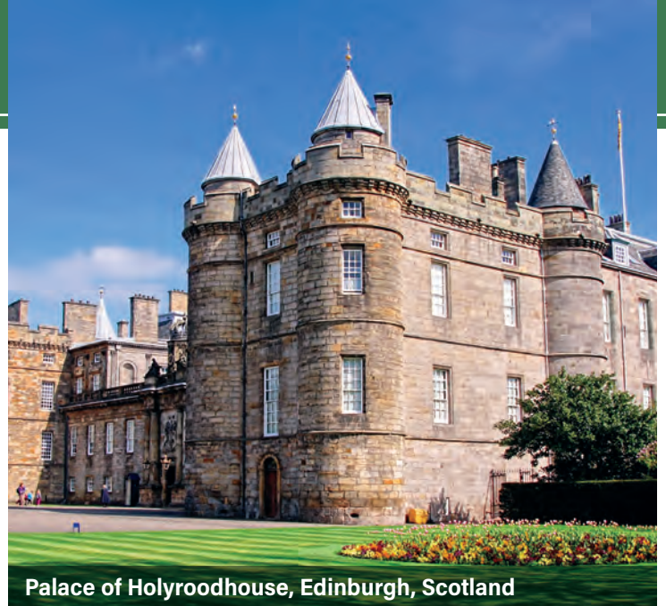
Palace of Holyroodhouse, Edinburgh, Scotland

property has evolved over time into a warm and welcoming family home. The privately-owned house and gardens, at the center of a thriving 9,500-acre agricultural estate, are home to the world's oldest topiary gardens. After time to wander in this lovely spot, continue to Holehird Gardens, with glorious views over Windermere to the fells beyond. Originally landscaped in Victorian times, the current gardens were created and are maintained entirely by volunteers from the Lakeland Horticultural Society. Return to your hotel, where the balance of the day is at leisure. (B)