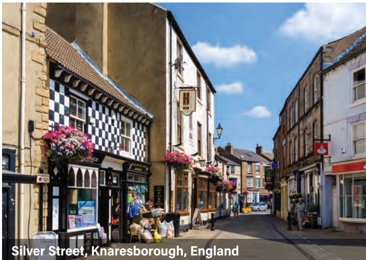
Silver Street, Knaresborough, England

After breakfast at the hotel, you will be introduced to Edinburgh through a combination of a panoramic coach tour of the city and a walking tour of some of its most important areas— the Royal Mile, the Princes Street Gardens, and Calton Hill. A highlight of the morning will be a visit to the Palace of Holyroodhouse, the King's official residence in Scotland. Located at the end of the Royal Mile, with the imposing volcanic outcropping of Arthur's Seat providing a dramatic backdrop, Holyrood offers the opportunity to explore the historic State Apartments, the ruins of Holyrood Abbey, and The Queen's Gallery. The balance of the day is at leisure with independent lunch and dinner. (B)