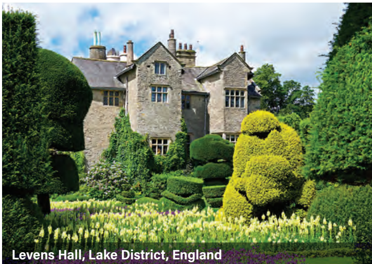
Levens Hall, Lake District, England