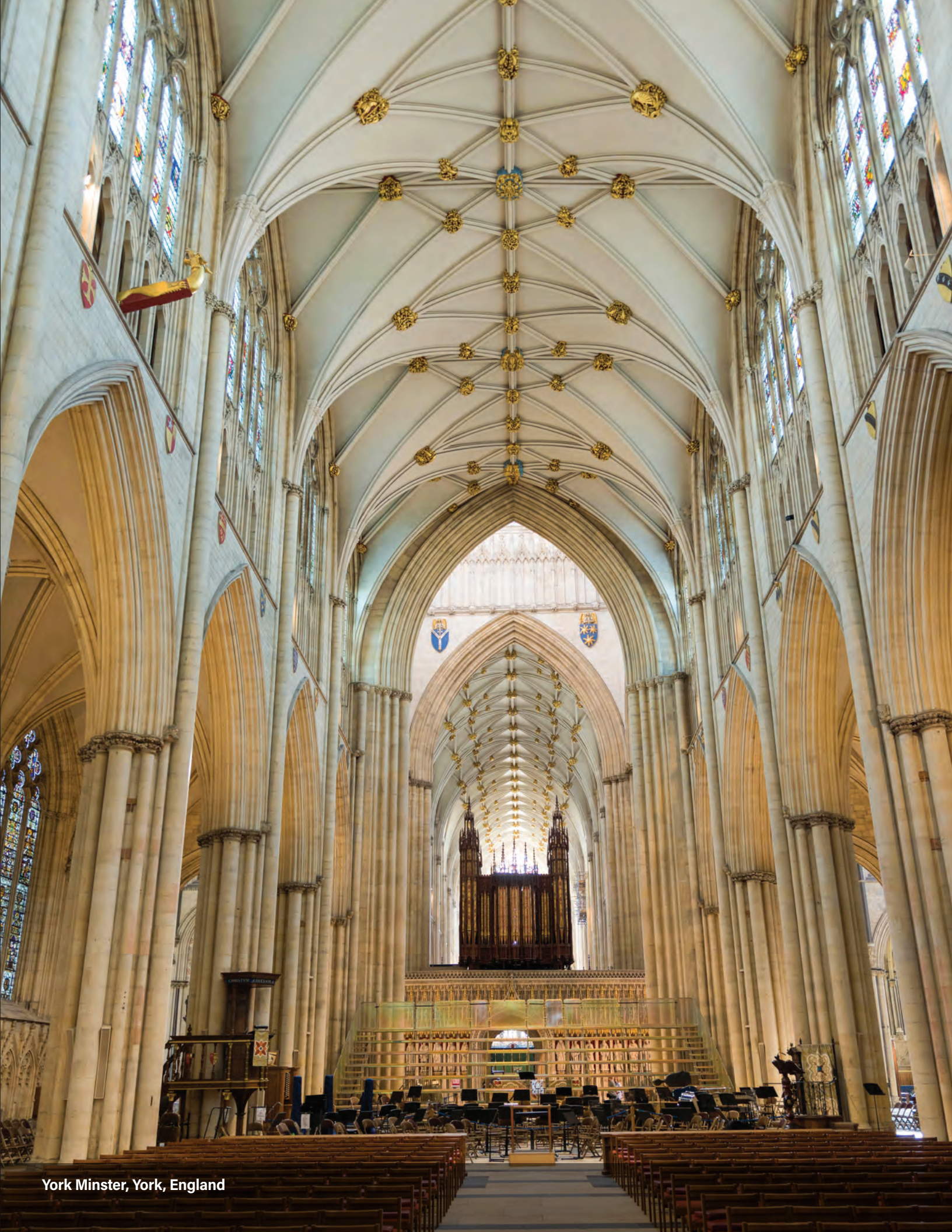
York Minster, York, England