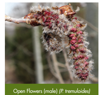
open nowers (male) (n. nemelela