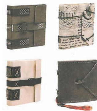
Monica Langwe Berg

Limp binding is characterized by simple, practical and extremely durable construction without stiff covers. It has been around since the 12th century, when it was used on merchants' account books and notebooks containing running notations. Limp structures were typically sewn with parchment and covered in vellum. Learn the history of limp binding and bind