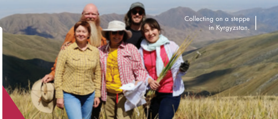
Collecting on a steppe in Kyrgyzstan.

In 2019, scientists spent the equivalent of 30 hours a week on outreach. Experience science outreach at the Gardens by visiting the new Science Pyramid exhibit, Welcome Home: Meet Your Habitat . This exhibit explores the ways in which the lives of Colorado's living things are deeply intertwined through landscapes and the finite resources we share.