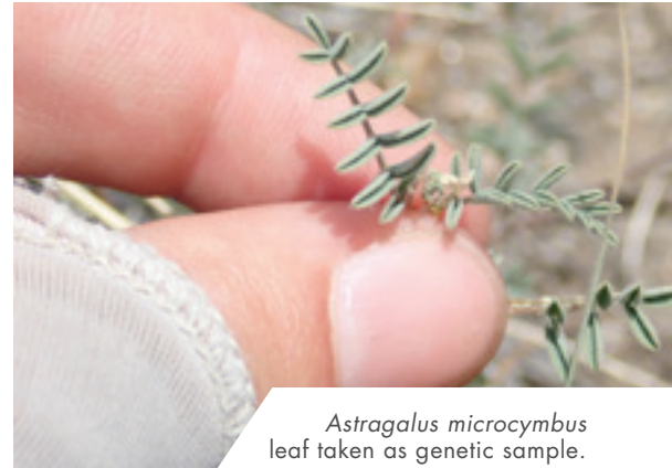
Astragalus microcybus leaf taken as genetic sample.