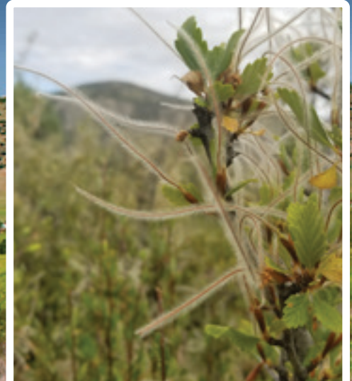
Cercocarpus montanus in fruit.