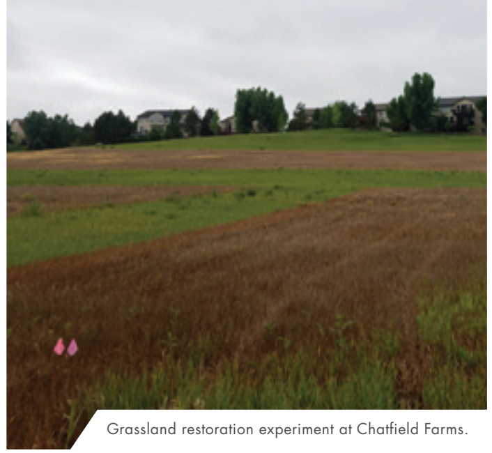
Grassland restoration experiment at Chatfield Farms.

In 2019, we expanded our grassland restoration research on the property. Through collaboration with researchers at the University of Colorado Boulder we are experimenting with ways to restore areas of smooth brome ( Bromus inermis ). These experimental methods include testing tilling, herbicide and seeding with native plants . The scope of this project allows for graduate students to engage in asking related questions, including the impacts of herbicides on soil microbial and pollinator communities. This project represents the initial phase of larger plans to conduct grassland restoration research at Chatfield Farms.