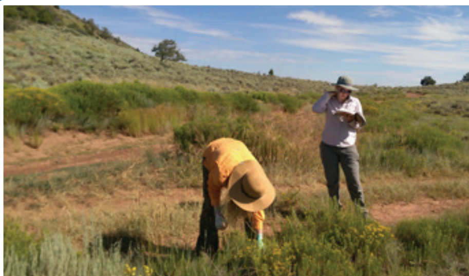
SOS botanists identifying Chrysothamnus viscidiflorus near Gypsum, Colorado.

2019 also saw the expansion of our research and restoration efforts onto wildlands throughout Colorado. Restoration of wildlands requires the availability of native seed and knowing which plants are appropriate to plant in which areas. The Bureau of Land Management (BLM) manages the Seeds of Success (SOS) program to ensure the nation has sufficient native seed for research, development, germplasm conservation and ecosystem restoration. This year, the Gardens served as a contractor for the BLM to collect SOS seeds in Colorado . A crew of three botanists spent six months travelling the state, exploring BLM properties to find appropriate species and returning at the right time to collect seed. Throughout the season, they spent 73 days in the field and collected seeds during 30 collection events (each of which is more than 10,000 seeds) from 16 species. The 34+ million seeds collected over the course of the 2019 season will be cleaned and sorted at the U.S. Forest Service's Bend Seed Extractory in Oregon. Ultimately, they will be used for research, conservation and ecosystem restoration in support of the BLM's Native Plant Materials Development Program. In 2020, the Gardens will have two crews collecting seed in Colorado and Wyoming for the SOS program. Using a common garden study at Chatfield Farms, one of our graduate students is using seeds from the SOS program and commercial growers to understand how the source of seeds used in restoration relates to plant performance.