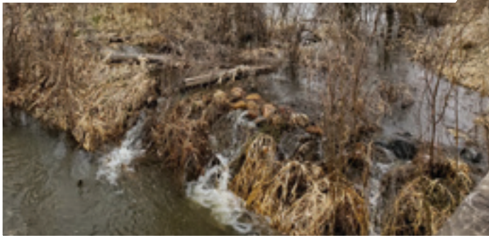
Long-term monitoring plot along Deer Creek at a beaver dam.