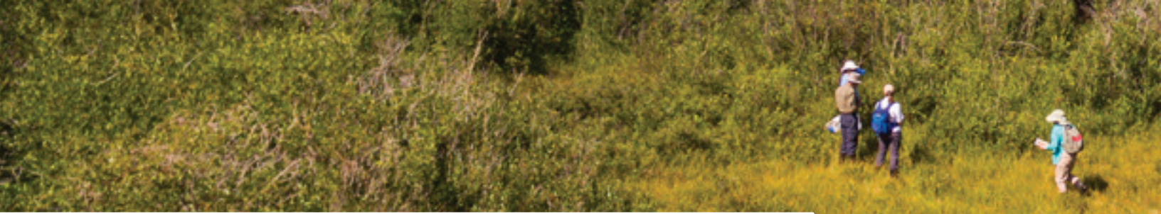
Making voucher collections in Gilpin County.