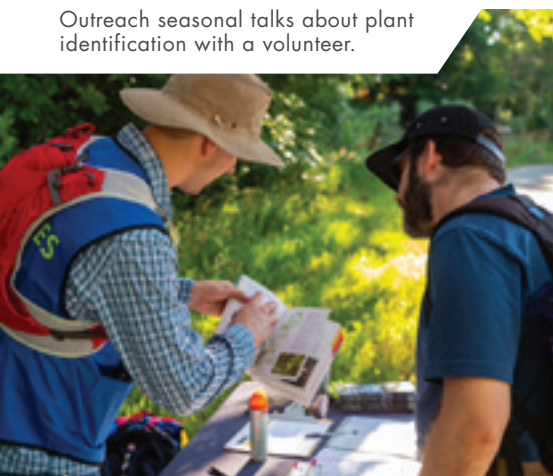
Outreach seasonal talks about plant identification with a volunteer.

Upon returning from the prairies and mountains, the next step in documenting Colorado's biodiversity is to curate and publish the scientific data collected in the field. The Gardens' researchers are dedicated to making data accessible for not only our own research, but for scientists and the general public across the globe. For example, in 2019 we published the Deer Creek Riparian Restoration Ecological Monitoring dataset on the Global Biodiversity Information Facility (GBIF). The dataset describes the ground vegetation, tree canopy, aquatic invertebrate community and any specimens collected at sites along Deer Creek at Chatfield Farms where an effort to restore the stream's natural hydrology is underway. Any and all of these data can now be incorporated into studies at any scale, as well as our own, to test the success of the restoration project and more.