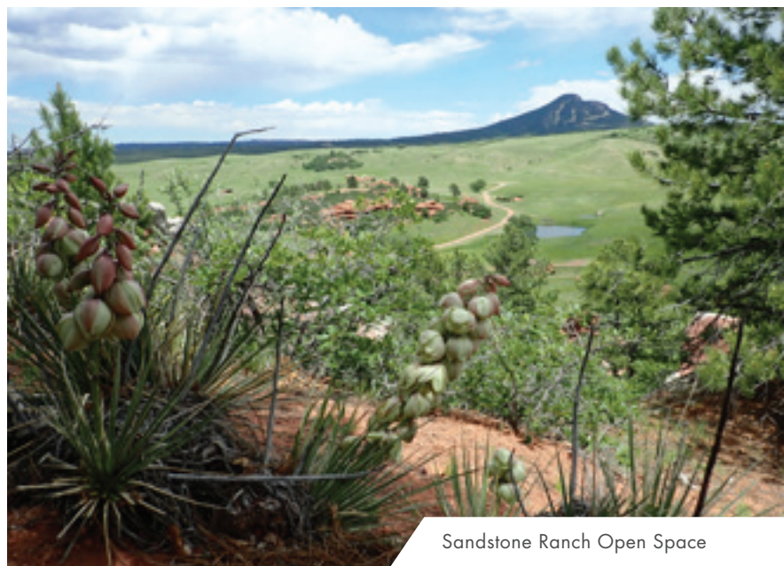
Sandstone Ranch Open Space

The importance of Open Space land is two-fold, with people benefitting directly from time spent in nature, as well as indirectly from ecosystem services provided by unbuilt, biodiverse land. As Open Space lands are acquired by local and regional municipalities, botanists gain the opportunity to work with engaged stewards and land managers while incorporating what were often previously inaccessible locations into their collections work. Such expanded access serves to robustly refine species distribution ranges, while at the same time providing on-the-ground information to people managing these properties and their habitats. In 2019, we worked on Sandstone Ranch Open Space , an approximately 2,000-acre property that was nearly converted for housing before its purchase by Douglas County. The season-long survey yielded just over 500 species and more than 50 county records. These records were unearthed in one of the most botanized areas in the state, illustrating there is always more to be discovered and we need ongoing collections work. Beyond growing our collections, we provided guidance to land managers by highlighting the locations of native species that would be particularly sensitive to land use change. We thus view this project as meaningful in both the applied and foundational arenas of botanical knowledge.