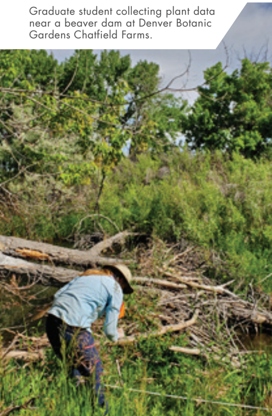
Graduate student collecting plant data near a beaver dam at Denver Botanic Gardens Chatfield Farms.

This summer our staff had a great time botanizing with members of the public who love their local greenway, the High Line Canal. Nearly 100 people spent their Saturday mornings photo-documenting plant species along this 71-mile corridor, learning about biodiversity and how to identify plants. Using iNaturalist, volunteers logged nearly 220 different species during more than 750 combined hours of work. A survey revealed that a key motivating factor among participants was simply the opportunity to spend time outside learning about plants and the greenway itself. As an institution that benefits greatly from our volunteers, we found it interesting that half of the people who converged on this wild, urban classroom were not current volunteers. We were gratified to see this expanded reach.