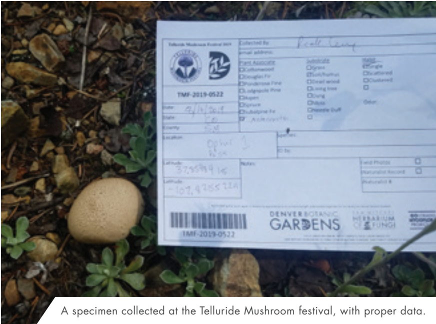
A specimen collected at the Telluride Mushroom festival, with proper data.