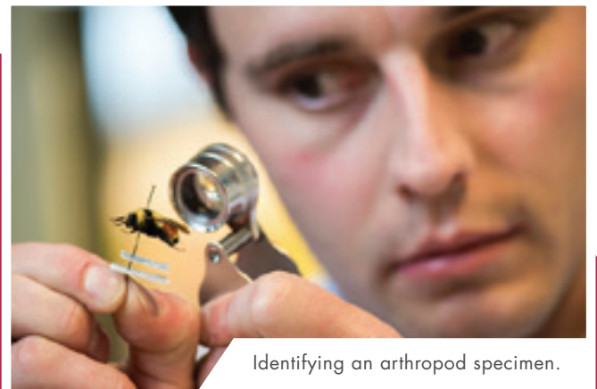
Identifying an arthropod specimen.

2019 was one of our most productive years on record for accessioning arthropod and fungal specimens! While many specimens were collected in years past, the nitty gritty work of identifying, cataloging and preserving these specimens was a major goal accomplished in 2019 prior to re-housing these collections in 2020.